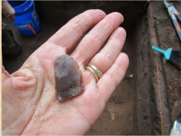
Blade also recovered in Unit M.