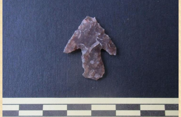
Check out this unusually thin (1.3 mm) point! Recovered on Saturday in Unit M