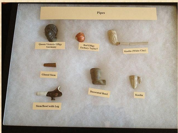
A display of pipes and stems