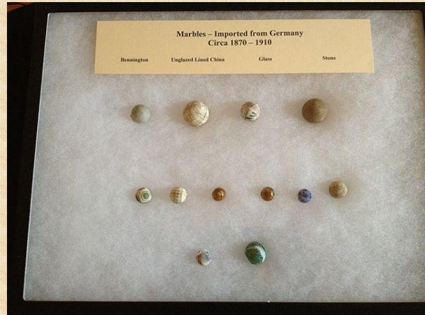
A display of marbles