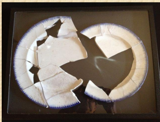
Partially reconstructed plates