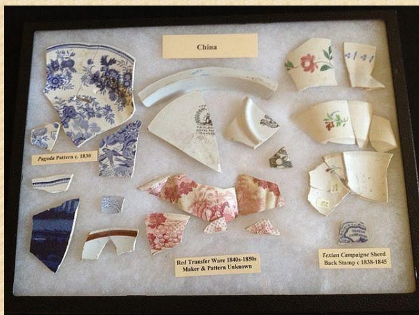
Various ceramics including transferware and a Texian campaign wear sherd