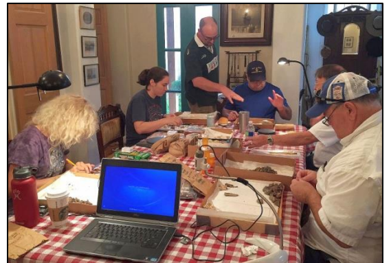
Team counting, weighing and sorting artifacts from the Cotton Field site