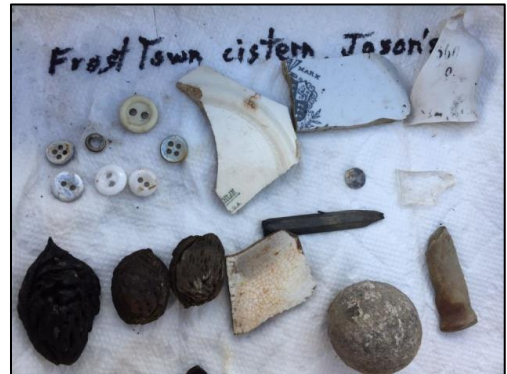
Artifacts from the Frost Town site