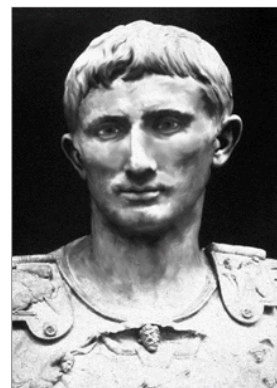
Augustus, First Roman Emperor, 63 BCE – 14 CE