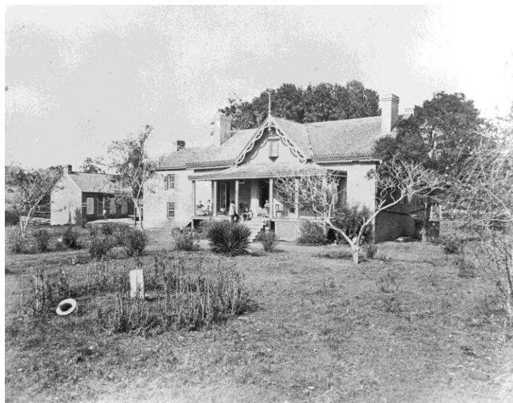
Waldeck Plantation House

LABORATORY SCHEDULE: Dec. 17 (only one time this month). 7-9 pm in Room 103, Sewall Hall, Rice University. Check the HAS website, www.houstonarcheology.org , for a map.