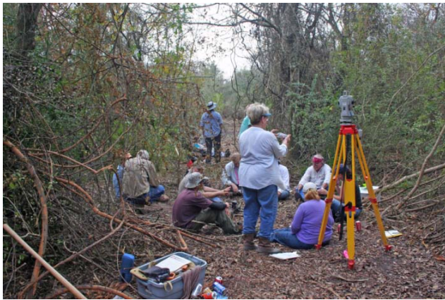
Excavators working at the site near San Jacinto. Can you spot the HAS members in this group?