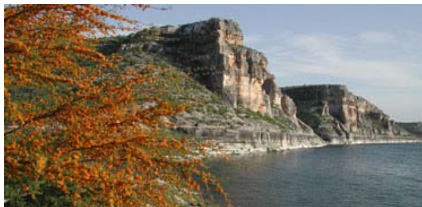
A view of Amistad Reservoir, a man-made lake shared by the US and Mexico, located on the Rio Grande below the Big Bend area.

With an estimated 1,400,000 prehistoric artifacts in the park’s museum collection, Amistad National Recreation Area has the third largest collection in the National Park Service.