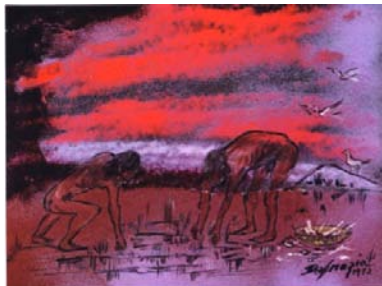
Indigenous people digging roots