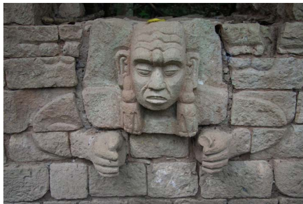
Bas-relief at the Copan site in Honduras