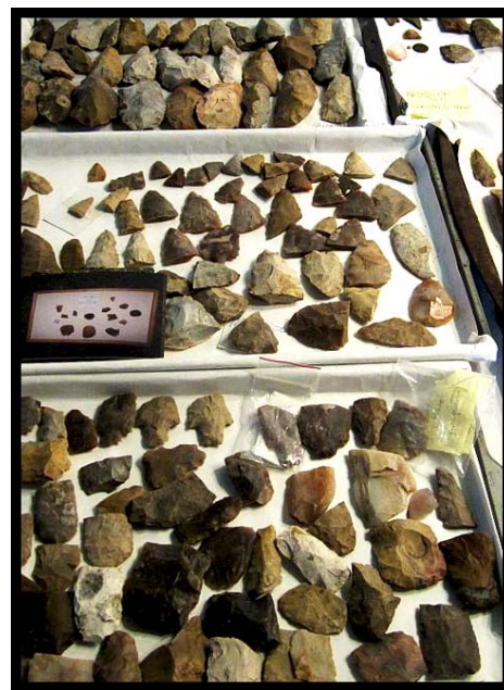
Figure 3: Hundreds of stone tool preforms have been discovered across exposed surfaces on the ranch, marking the location of prehistoric lithic quarries.