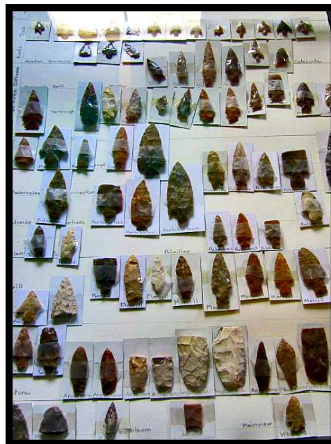
Figure 1: Dart and arrow points found in surface contexts and road cuts date to the Paleoindian through Late Prehistoric periods.

have identified Colorado County it as part of the Central Texas culture area, while others have identified it as