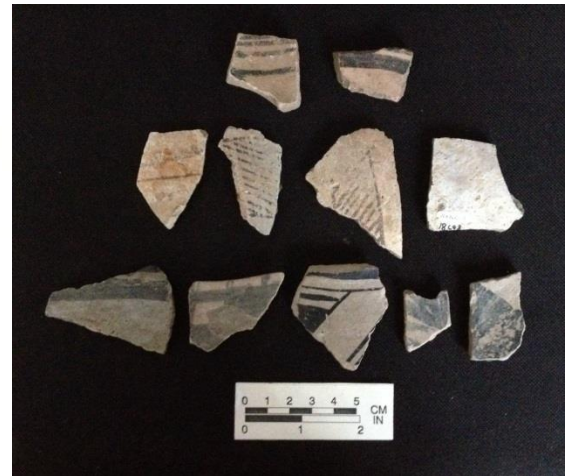
Puebloan pottery sherds recovered along the East Fork of the Trinity River