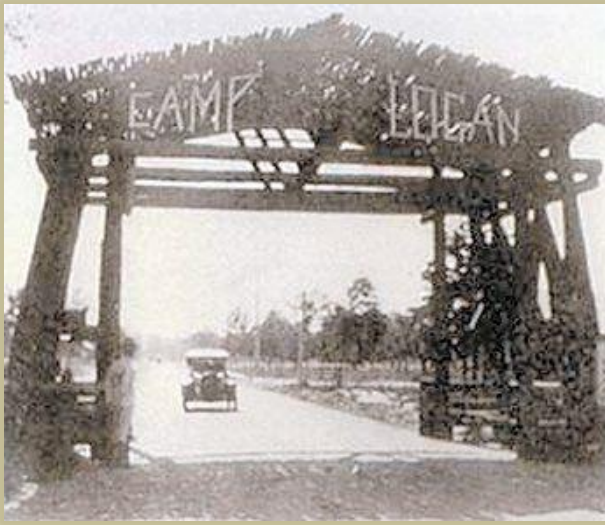
Camp Logan entrance gate near today's Westcott/Washington roundabout