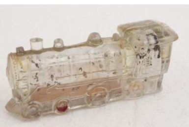
1930s locomotive, Victory Glass Co. Jeanette, Pa.