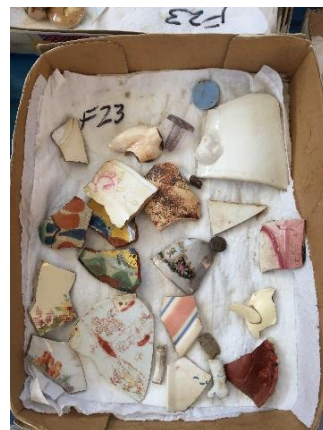
Patterned and painted ceramics