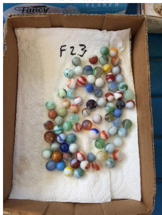
We recovered a huge number of marbles at the site – this is just a small collection