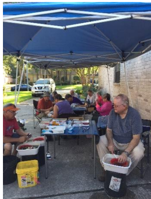
More of the lab team washing artifacts.