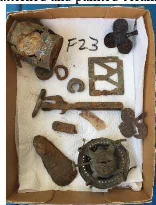
Interesting metal artifacts