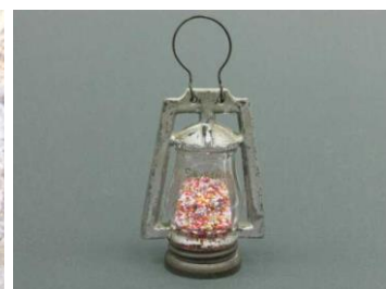
1900s barn style lantern, West Bros. Grapeville, Pa.