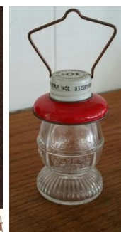
1950s ribbed base lantern, T.H. Stough Co. Jeanette, Pa

Shards recovered and not shown included a 1940s rabbit by T.H. Stough Co. and a 1940s streamlined car by the Victory Glass Co.