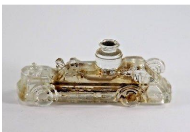
1940s fire engine, Victory Glass Co. Jeanette, Pa