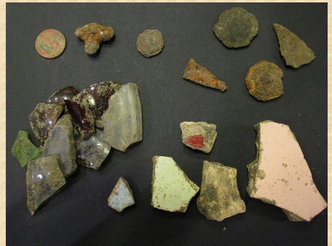
A sample of artifacts recovered including metal, glass and ceramics, before cleaning and identifying.