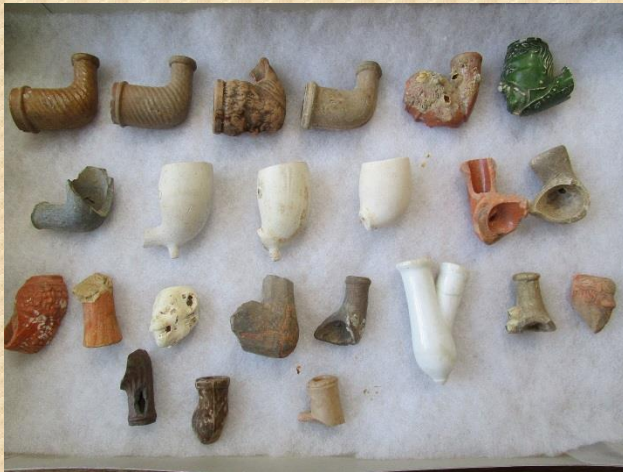
Clay pipes recovered from the San Jacinto town site mudflats include two effigy pipes identified as Ulysses S. Grant and Zachary Taylor and several other decorated pipe.