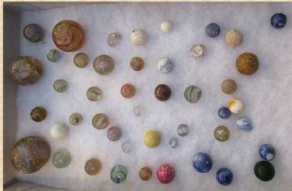
Marbles including sulphites, clay and glass.