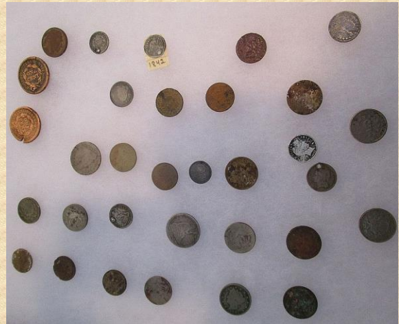
Coins dating back to 1829. Several of them have holes in them indicating that they were either sewn into clothing or used as a pendant.