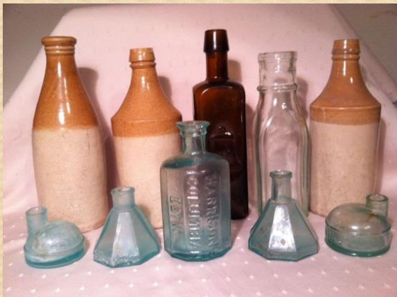
Bottles including "turtle" and "umbrella" ink bottles, ale bottles and medicine bottles.