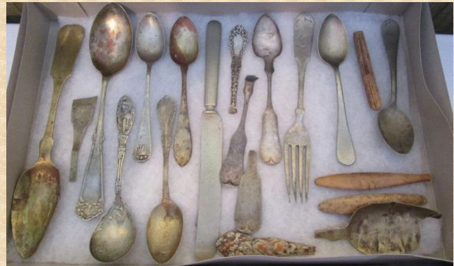
A collection of silverware – spoons, forks and knives