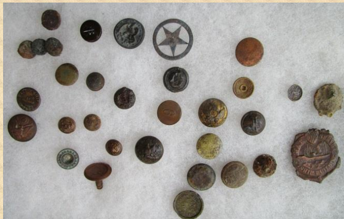
Buttons including a Mexican Army 6th battalion button, Republic of Texas Navy Button, Civil War Cavalry, Infantry and Artillery buttons, a Terry's Texas Rangers badge, A WWI shipbuilding badge and more.