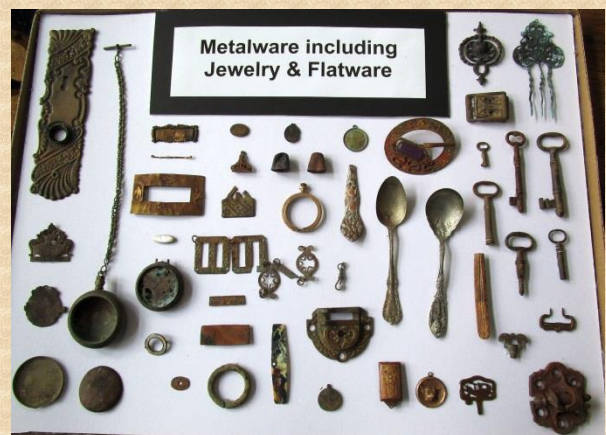
Miscellaneous metal items, watch parts, buckles, cutlery, keys and brooches.