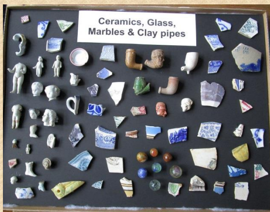
A collection of ceramics, glass, and clay pipes