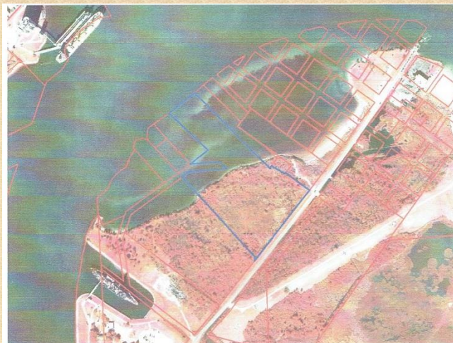
This map is an overlay showing the town site of San Jacinto over what the site looks like today. The area from which the artifacts were recovered is completely underwater