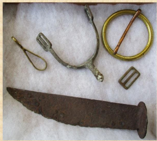
Bowie Knife and buckles. Interestingly during the Civil War the sawmill that was located in the San Jacinto town site was turned into an armory and produced Bowie Knives and other armaments. Could this knife have been made at that armory?