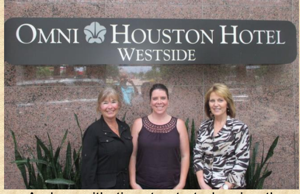
.... And now it's time to start planning the next TAS Annual Meeting at the Omni Houston Hotel Westside October 23 – 25, 2015. HAS will be the host and sponsor so let's make it the best ever!