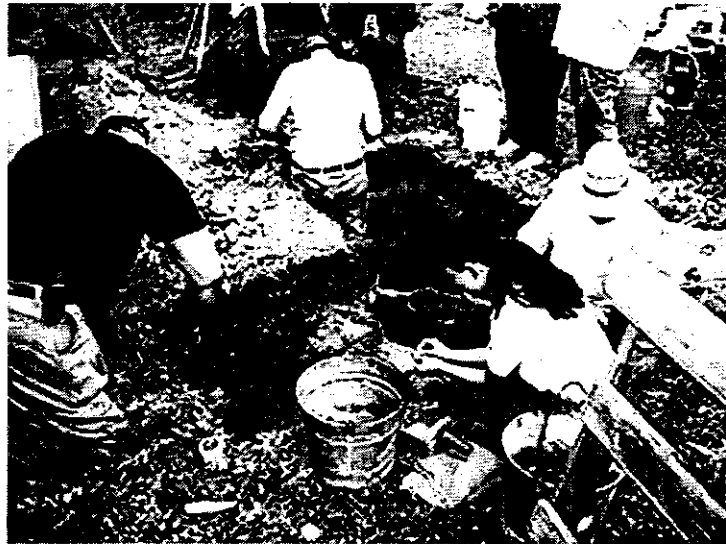
HAS dig at the Maison Rouge site on Galveston Island, Texas, October 2004.