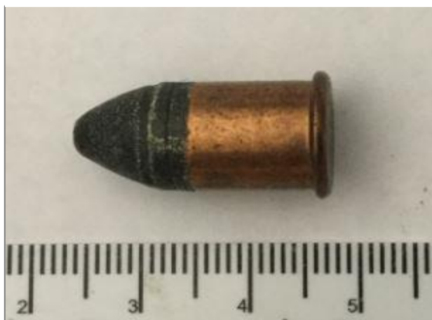
.41 caliber rimfire Short cartridge. Author's collection.

A rimfire cartridge is a complete unit of ammunition consisting of a case, priming compound, gun powder and bullet. After someone shoots a rimfire cartridge in his gun, the only remaining part of the cartridge is the non-reloadable case; hence, the shooter usually discards the case where he is standing.