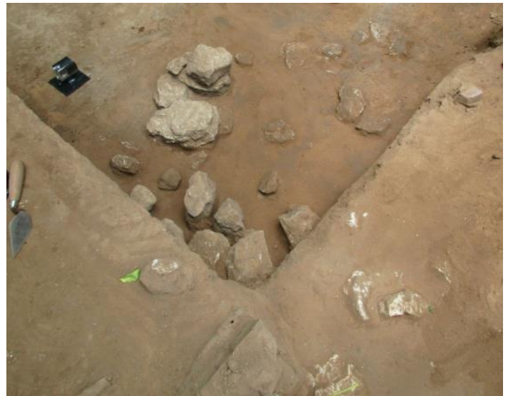
Unusual rock features in three adjoining units